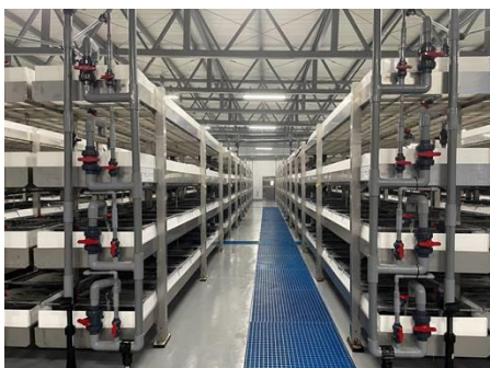
Urchinomics Raching Site